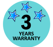
3 Years Premium warranty