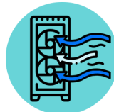
Mid Tower Custom Air Flow