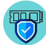
PCI 4.0 High Endurance